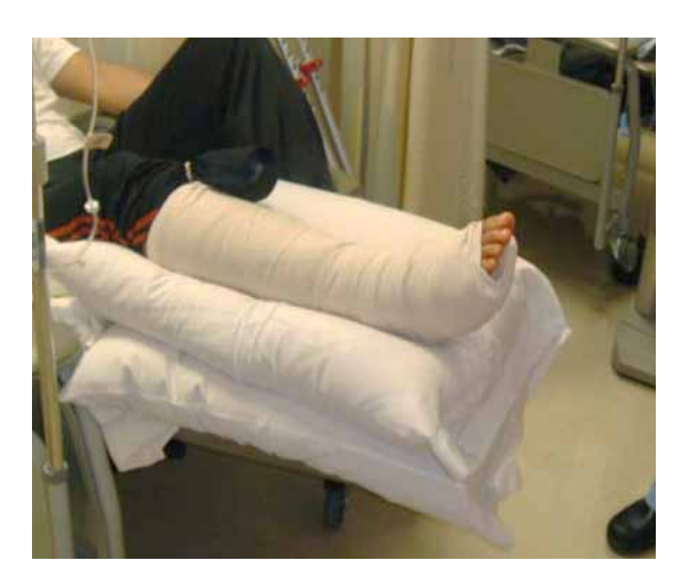
Elevate your leg on two pillows to keep it above the heart.